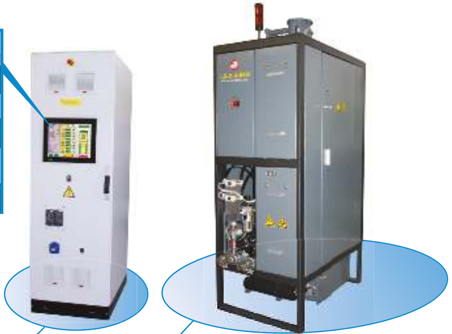
Automatic Control Rack