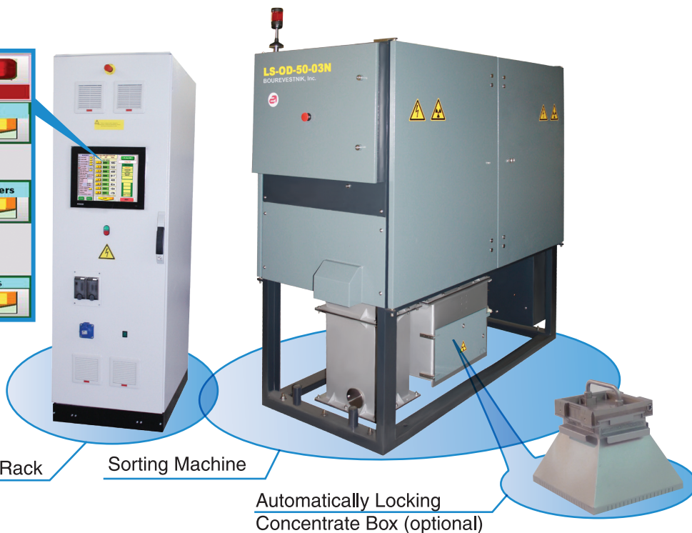
Automated Control Rack