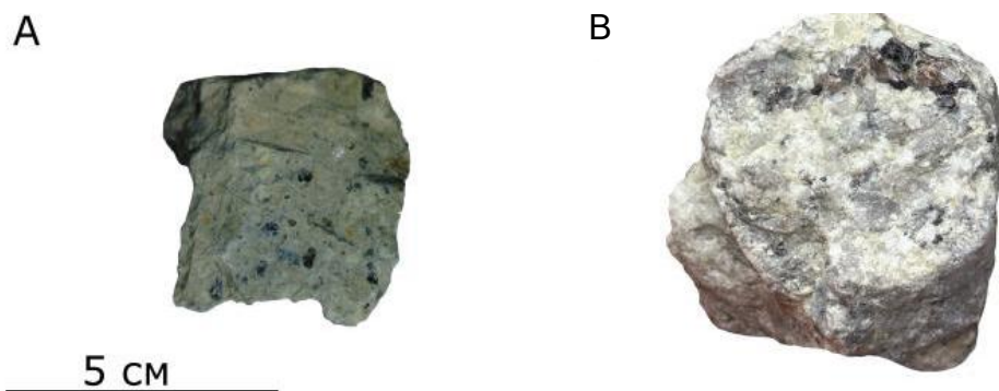
Figure 2. Samples of host rocks: a – rhyolite, b - quartz veining